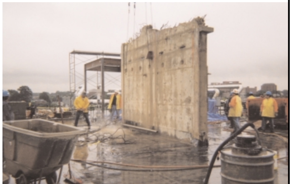
Above Top: The first step was to remove the cantilevered floor to be able to gain access to the concrete panels underneath.